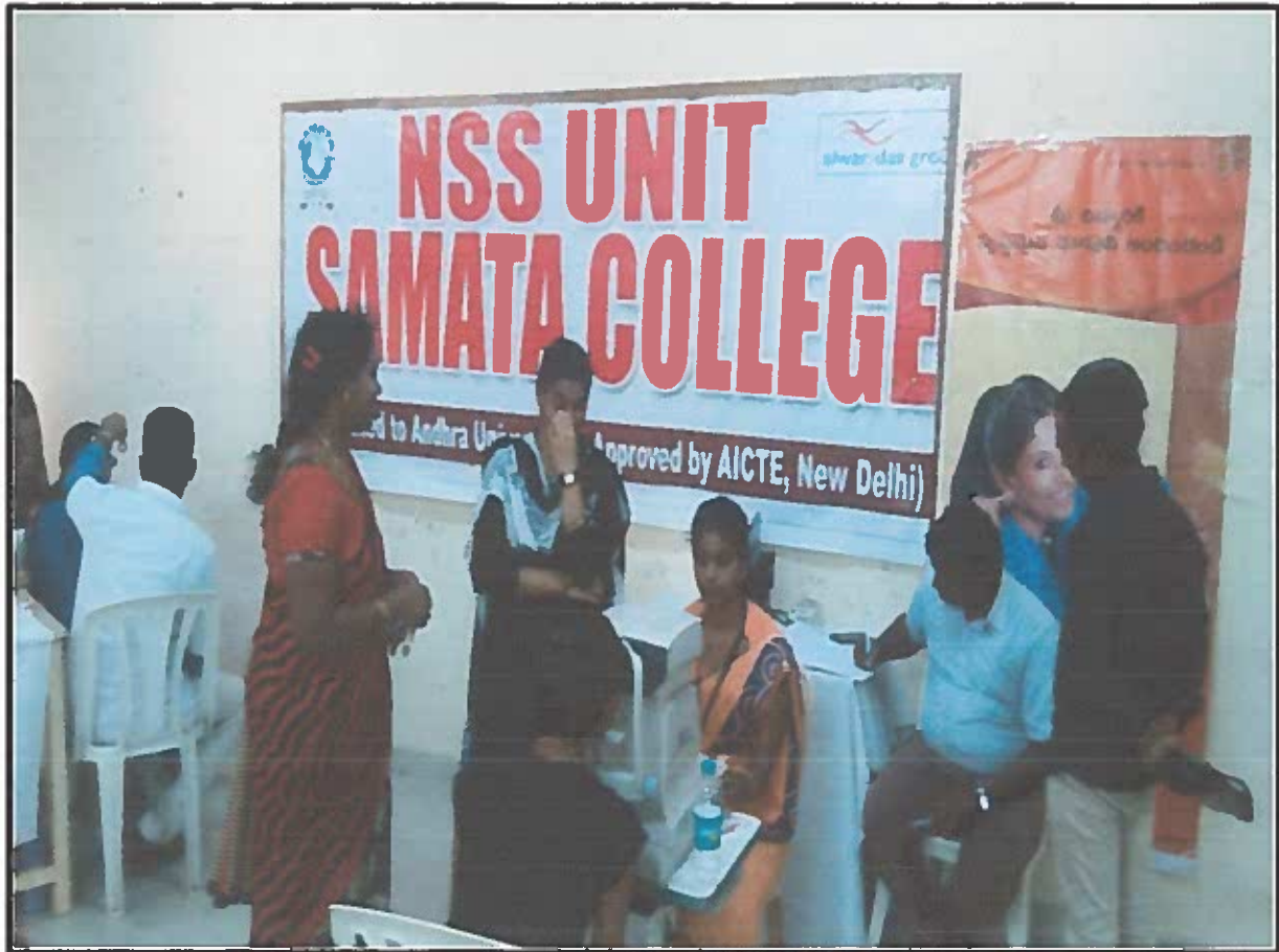
Students and Faculty Participating in Eye Check-up Camp