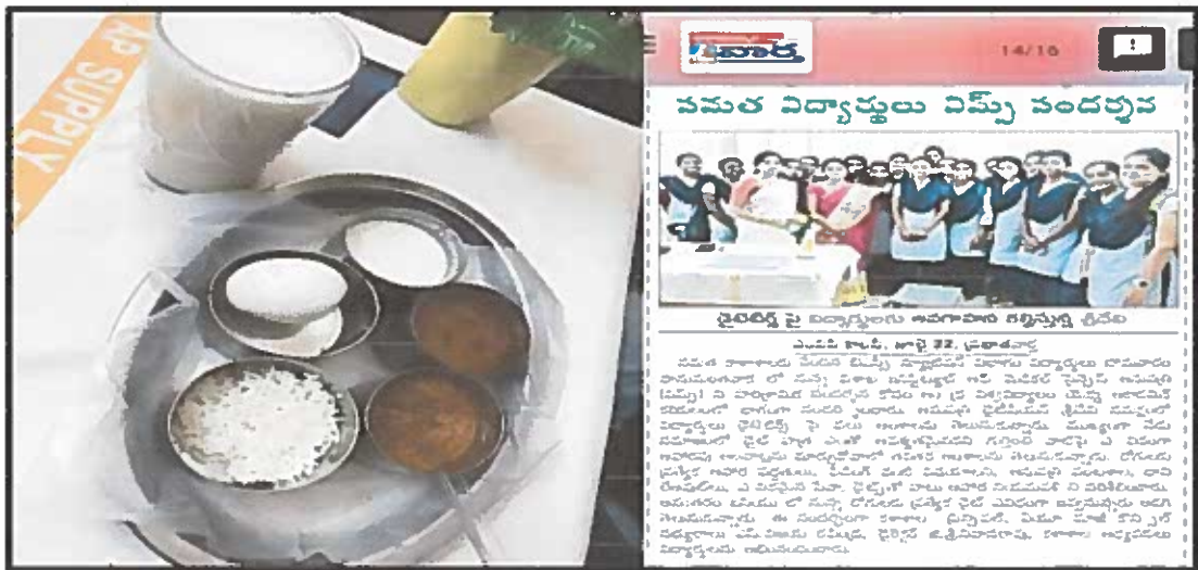
Role of Diet and Nutrition for Cancer Patients in Treating Cancer Drive Published in Newspaper