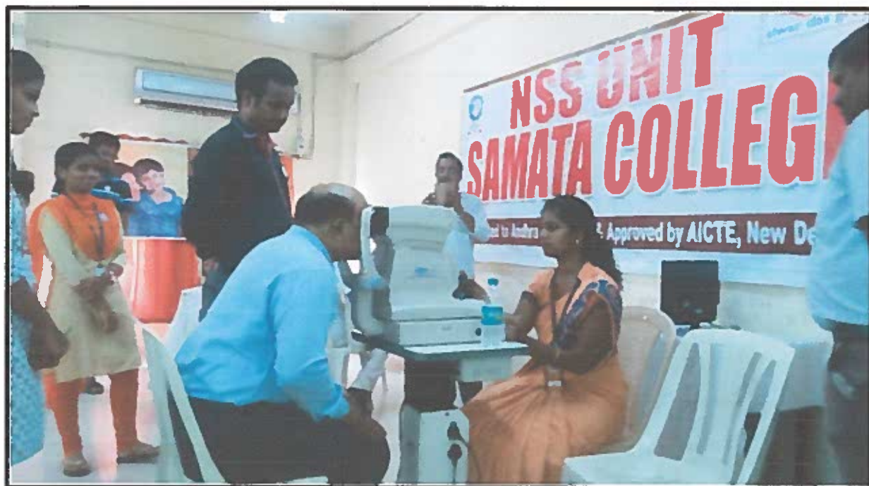
Students and Faculty Participating in Eye Check-up Camp

Phone: 0891 – 2504682. Website: www.samatacollege.co.in