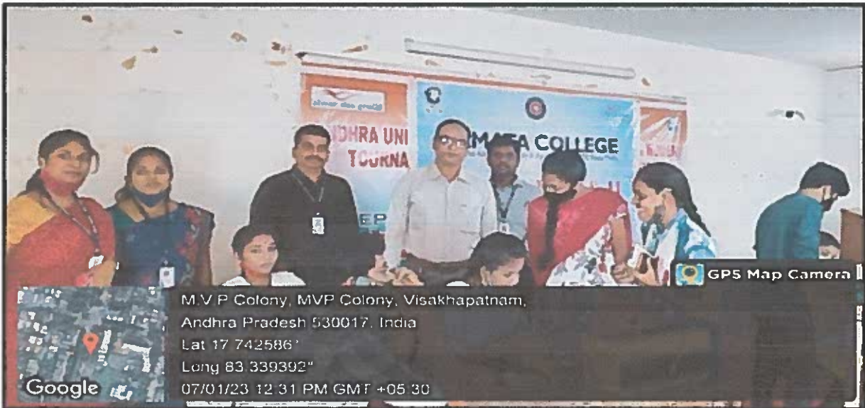
Students and Faculty Participating in COVID Vaccination Drive