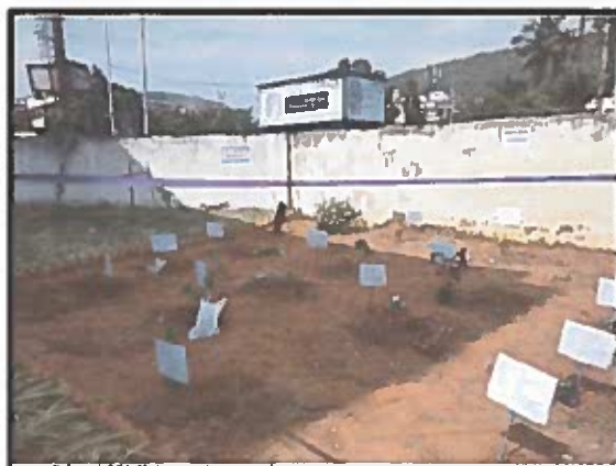
Students Participating and Planted in Medicinal Gardening Program