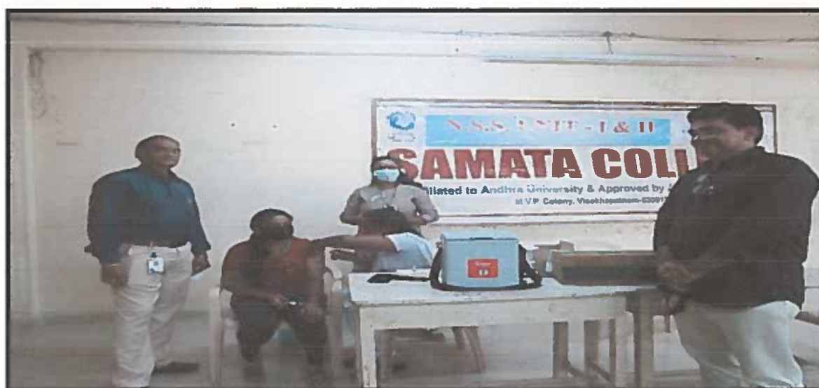
Public getting benefit out of our COVID Vaccination Drive