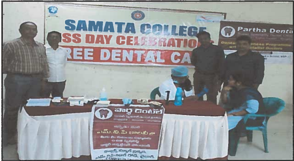
Students and Faculty Participating in Dental Camp