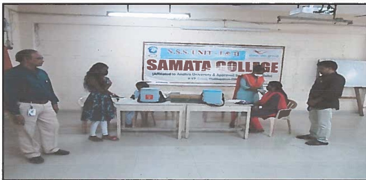
General public Participating in COVID Vaccination Drive