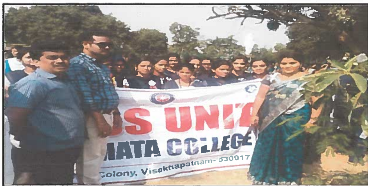
Faculty and Students Participating in Medicinal Gardening Program

Phone: 0891 – 2504682. Website: www.samatacollege.co.in