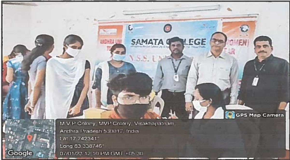
Students and Faculty and General Public Participating and Getting the COVID Vaccination