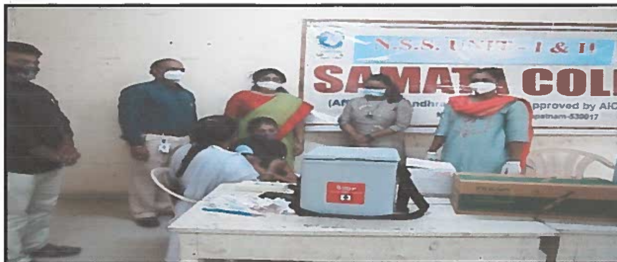
Medical professionals giving COVID Vaccination